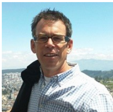
Dr. John Cameron

efforts of Canadian international development NGOs to influence federal government laws and policies in Canada and to support partner organizations in other countries in struggles to change laws and policies that undermine human rights and social justice. Initial findings, based on analysis of data on thousands of NGOs from 1990 to 2016 shows that very few international development NGOs are seriously involved in public policy advocacy work, partly because of very restrictive government regulations and partly because few Canadians are willing to donate funds to support policy advocacy. To learn more, check out John's research website: http://johndcameron.com