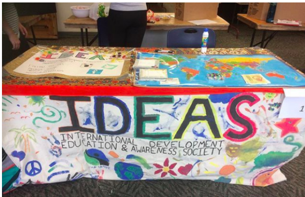
IDEAS is a student society ran for and by students within the IDS department at Dalhousie.