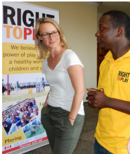
The transformative power of play should not be underestimated when it comes to International Development.