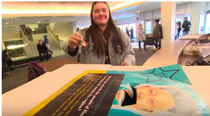
In partnership with No Chain for North Korea, students can donate their USB drives, which will be used to send media into North Korea.